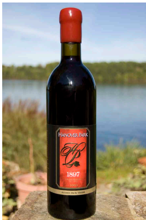
Hanover Park’s premier wine, 1897

Let’s start with the big picture. The world of wine is divided into two parts. There are “Old World” wines and there are “New World” wines. Or maybe even a little simpler, there are wines from Europe and there are wines from everywhere else in the world. The two types of wine are different—they give you different taste experiences and, on the label, they are categorized and described differently.